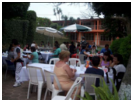
Top: Sunday service on “Día de Amigos.” Bottom: Fellowship meal following the service with “mixiotes.”