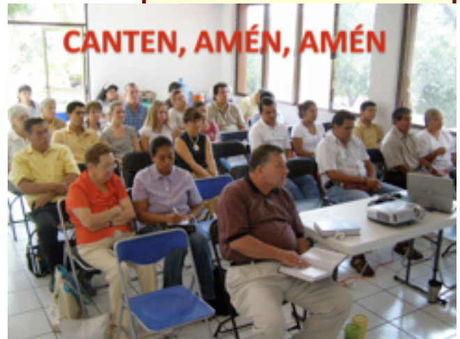
Sunday morning service in The Pradera